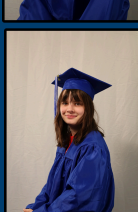
SUMMER HILL Liberty University Elementary Education/Art